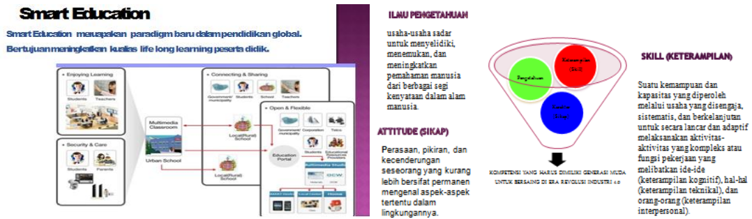
Fig 3. Learning and Learning in the Era of the Industrial Revolution 4.0 and the Role of Technology in Preparing the Young Generation for the Industrial Revolution 4.0

Preparation of the Young Generation to Face the Industrial Revolution 4.0, explained that technology is very necessary to support the achievement of the success of the younger generation in the future.