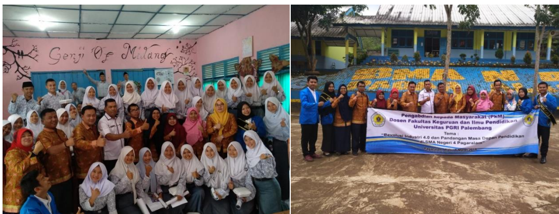
Fig 5. Photo Together

The expected impact of teachers and students increasingly understand the importance of preparation in the world of education in the face of the Industrial Revolution 4.0 era.