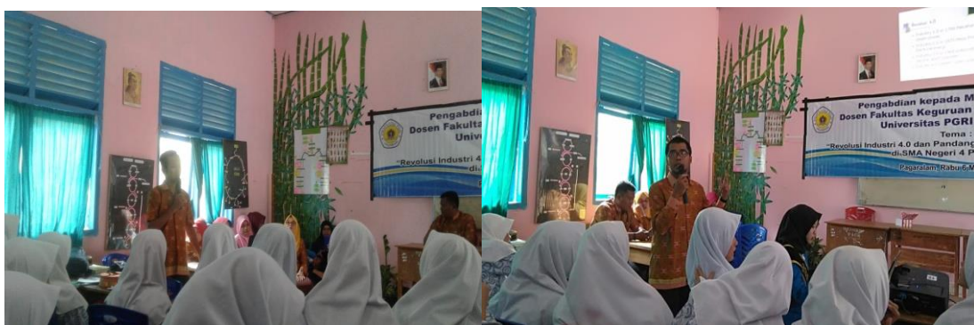
Fig 4. Submission of material by the presenter

Preparation of the Young Generation to Face the Industrial Revolution 4.0, explained that technology is very necessary to support the achievement of the success of the younger generation in the future.