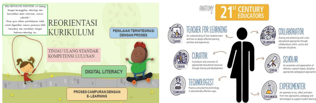
Fig 2. The Strategy of Educators in Entering and the Role of Education in the Industrial Revolution Era 4.0

The Strategy of Educators Entering the Industrial Revolution 4.0 and the Role of Education in the Era of the Industrial Revolution 4.0 can be seen in the image below.